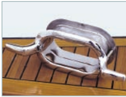
1000C 3 1/2" x 7 1/2" Hawse Cleat 3" Spigot