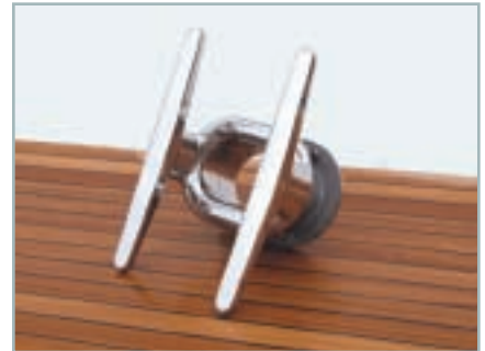
1015DC 3 5/8" x 6 5/8" Double Hawse Cleat 3.5" Spigot