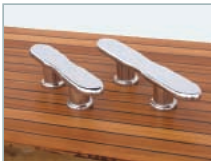
1017 15" Cleat 1018 18" Cleat