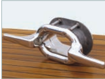
1015C 3 5/8" x 6 5/8" Hawse Cleat 3.5" Spigot