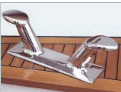
1016 16" Bollard