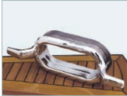
1005C 5" x 12 1/2" Hawse Cleat 3" Spigot