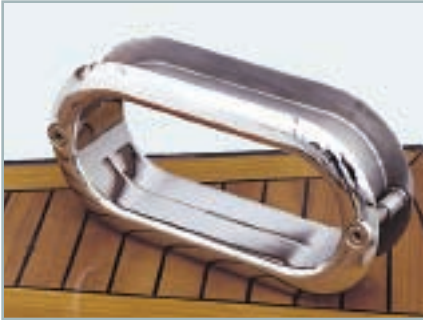
1005 5" x 12 1/2" Hawse 3" Spigot