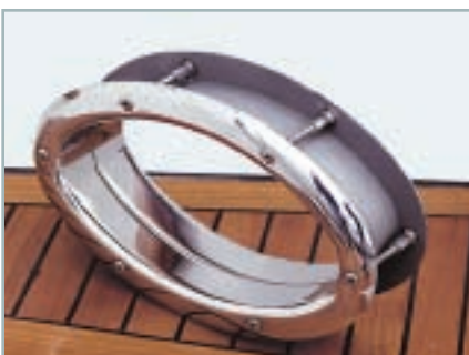
1010 5 1/4" x 11" Elliptical Hawse 3" Spigot