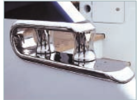
CUSTOM DESIGNED HARDWARE