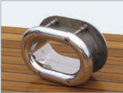
1015 3 5/8" x 6 5/8" Hawse 3.5" Spigot