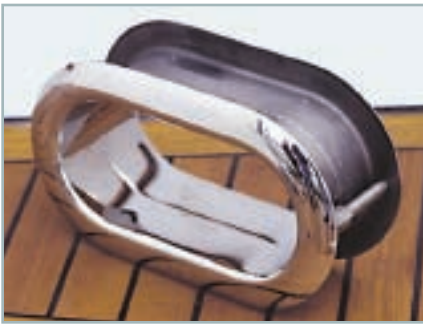
1000 3 1/2" x 7 1/2" Hawse 3" Spigot

All stainless steel hardware is passivated for lasting quality and polished to a mirror finish.