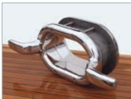
1025 6 3/8" x 11 7/8" Hawse 4" Spigot 1025C 6 3/8" x 11 7/8" Hawse Cleat 4" Spigot (shown) 1025R 6 3/8" x 11 7/8" Hawse with Roller 4" Spigot