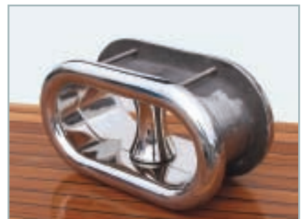
1030 6 3/8" x 14 7/8" Hawse 6" Spigot 1030C 6 3/8" x 14 7/8" Hawse Cleat 6" Spigot 1030R 6 3/8" x 14 7/8" Hawse with Roller 6" Spigot (shown)

It's easy to get more info. Request a quote at www.steelheadmarine.net or call us at (604) 826-1668 so we can answer your questions or get you a quote.