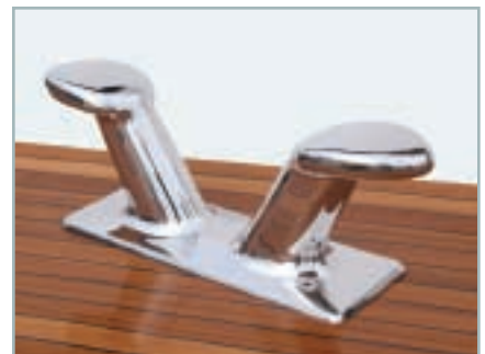
1020 20" Bollard