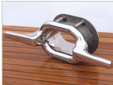
1015C 3 1/2" x 6 1/8" Hawse Cleat 3.5" Spigot