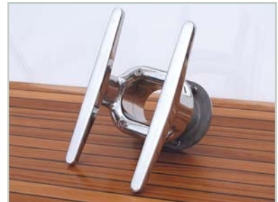
1015DC 3 1/2" x 6 1/8" Double Hawse Cleat 3.5" Spigot