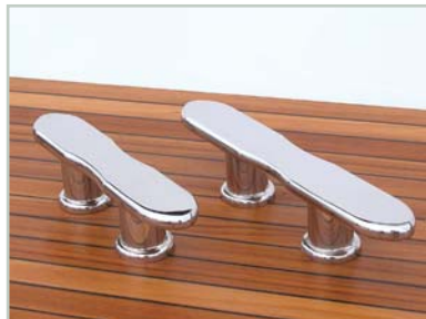
1017 15" Cleat