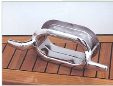
1000C 3 1/2" x 7 1/2" Hawse Cleat 3" Spigot