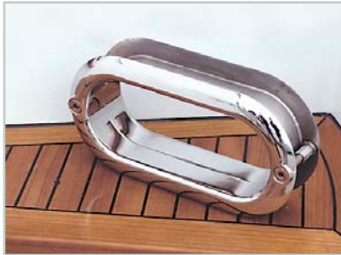
1005 5" x 12 1/2" Hawse 3" Spigot