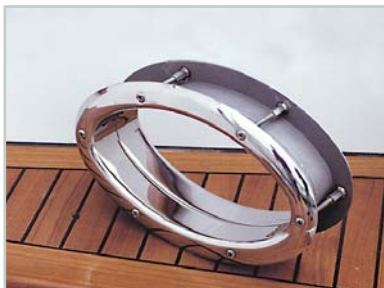
1010 5 1/2" x 11" Elliptical Hawse 3" Spigot