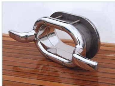
1025 6 3/8" x 11 1/8" Hawse 4" Spigot