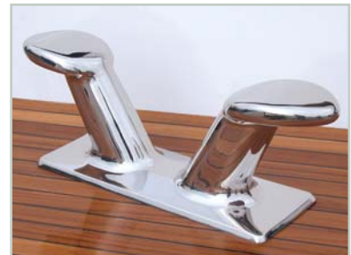
1020 20" Bollard