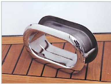
1000 3 1/2" x 7 1/2" Hawse 3" Spigot