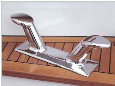
1016 16" Bollard