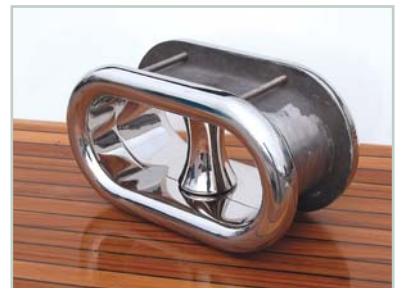
1030 6 3/8" x 14 1/8" Hawse 6" Spigot