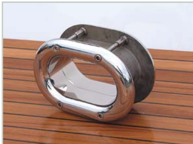
1015 3 1/2" x 6 1/8" Hawse 3.5" Spigot