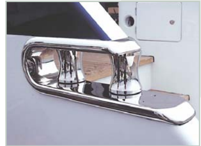
CUSTOM DESIGNED HARDWARE